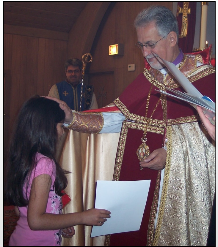
A Little Light Humor – Touching Words from the Mouths of Babes

Plan on joining Sunday School in September!